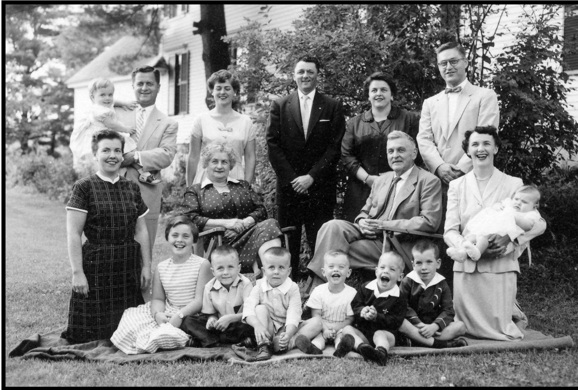
Hubbard Family Christmas card in the 1950s