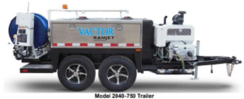
Model 2040-750 Trailer