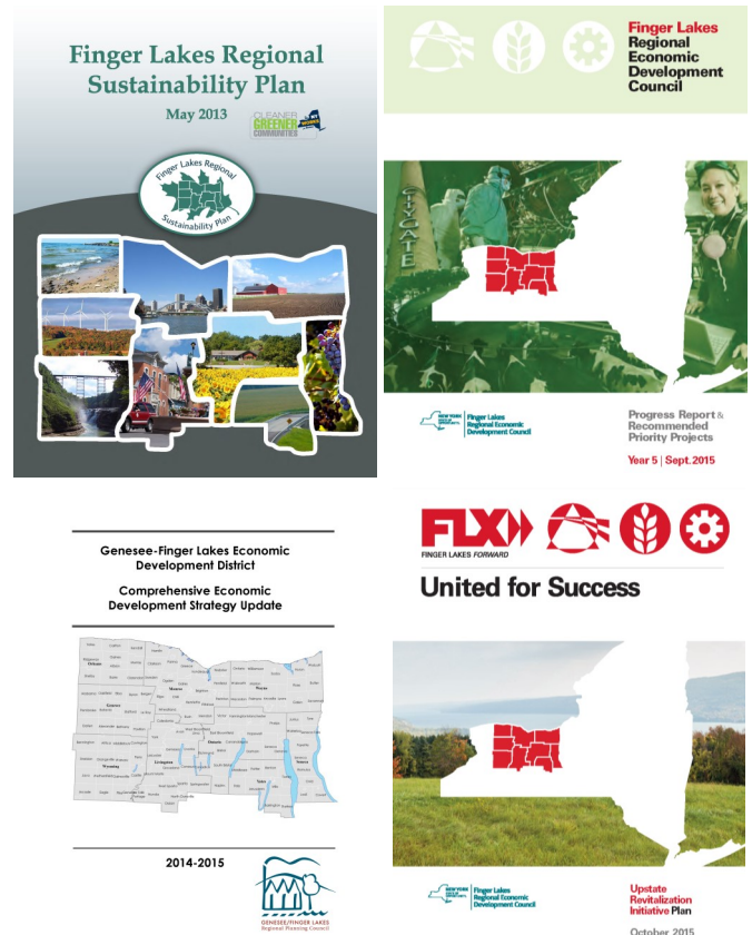
Map A: Genesee-Finger Lakes Region