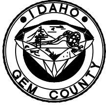
EXHIBIT 6-1 ADOPTED BY THE BOARD OF COUNTY COMMISSIONERS DECEMBER 31, 2012