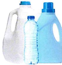
Plastic Bottles & Jugs